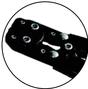
Spring steel made jaw